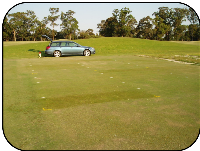
The trial site is shown above after the application on February 12 th 2008